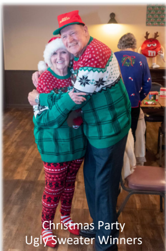
Christmas Party Ugly Sweater Winners